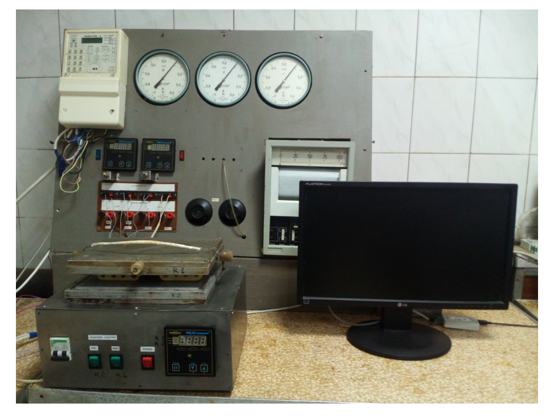
Fig. 2. Experimental stand for studying the process of the bilateral frying of meat natural products