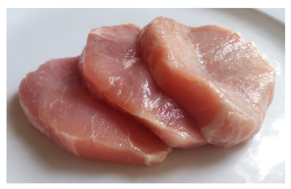
Fig. 3. Natural semi-products of pork

To determine the thermodynamic process duration in capillary menisci using the digital Dictaphone LG, the sound of the frying process was recorded. The Dictaphone was placed on the support at the semi-product height at the distance 0,2 m from the front of the research-experimental sample of the apparatus. For the further analysis of the sound file Fabfilter Pro·Q2 (Fabfilter software instruments, country producer – USA, Canada) and Spectrum Player (Isualization Software LLC, country producer – USA) programs were used.