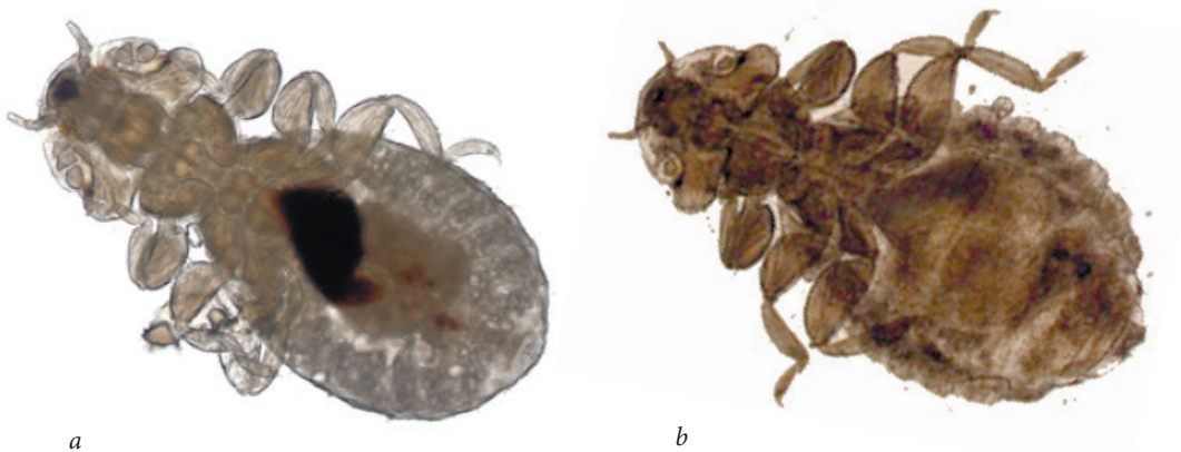
Fig. 3. Fam. Menoponidae: a — Bonomiella columbae — general view; b — Hohorstiella lata — general view.

Sex dimorphism is peculiar for all pigeon lice species revealed by us: males are smaller, than females (table 2).